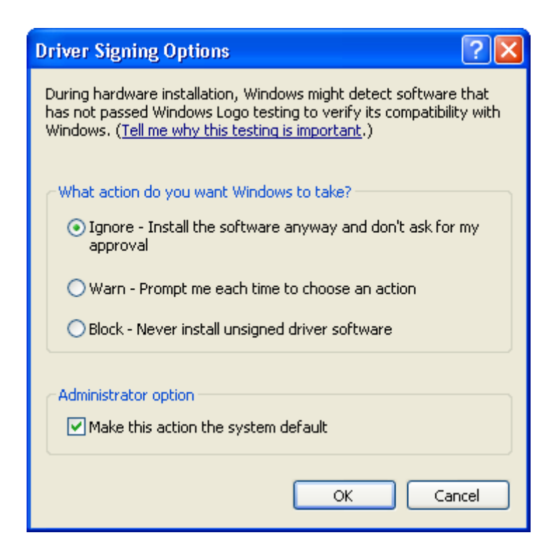
Figure 2. Driver Signing Options Window